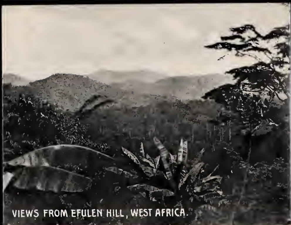
VIEWS FROM EFULEN HILL, WEST AFRICA.